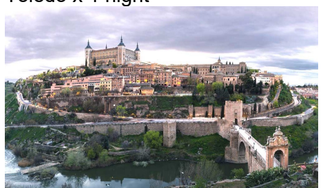
Toledo x 1 night

On the way to Salamanca we recommend to pass trough Avila and visit this city with its famous walls. You can even have a walk on this walls and discover the city from above. Before leaving Avila taste the famous "solomillo de Avila" in one of the little restaurants. Arriving in Salamanca you will get amazed from the monumental area around the university and cathedral. We recommend a visit to the tower of the cathedral with fantastic views. Stroll over the "plaza mayor" and have a typical "Chanfaina" (lamb stew).